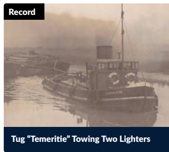
Tug "Temerite" Towing Two Lighters

Coasts in Mind is launching our digital map on 19th May!